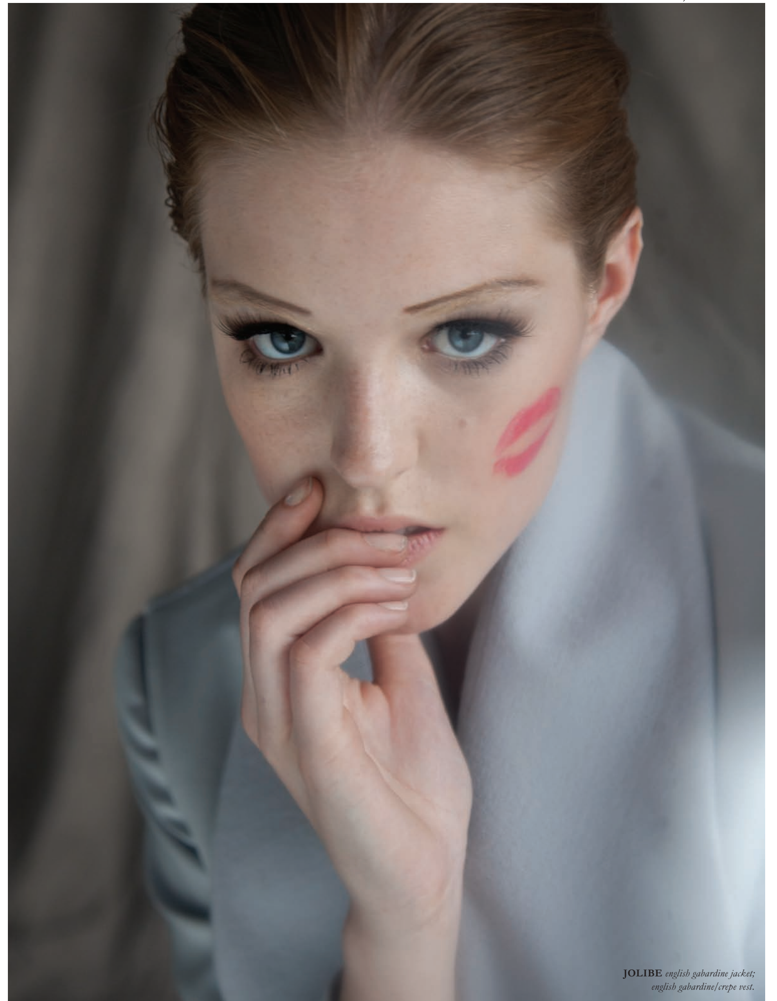
JOLIBE english gabardine jacket; english gabardine/crepe vest.