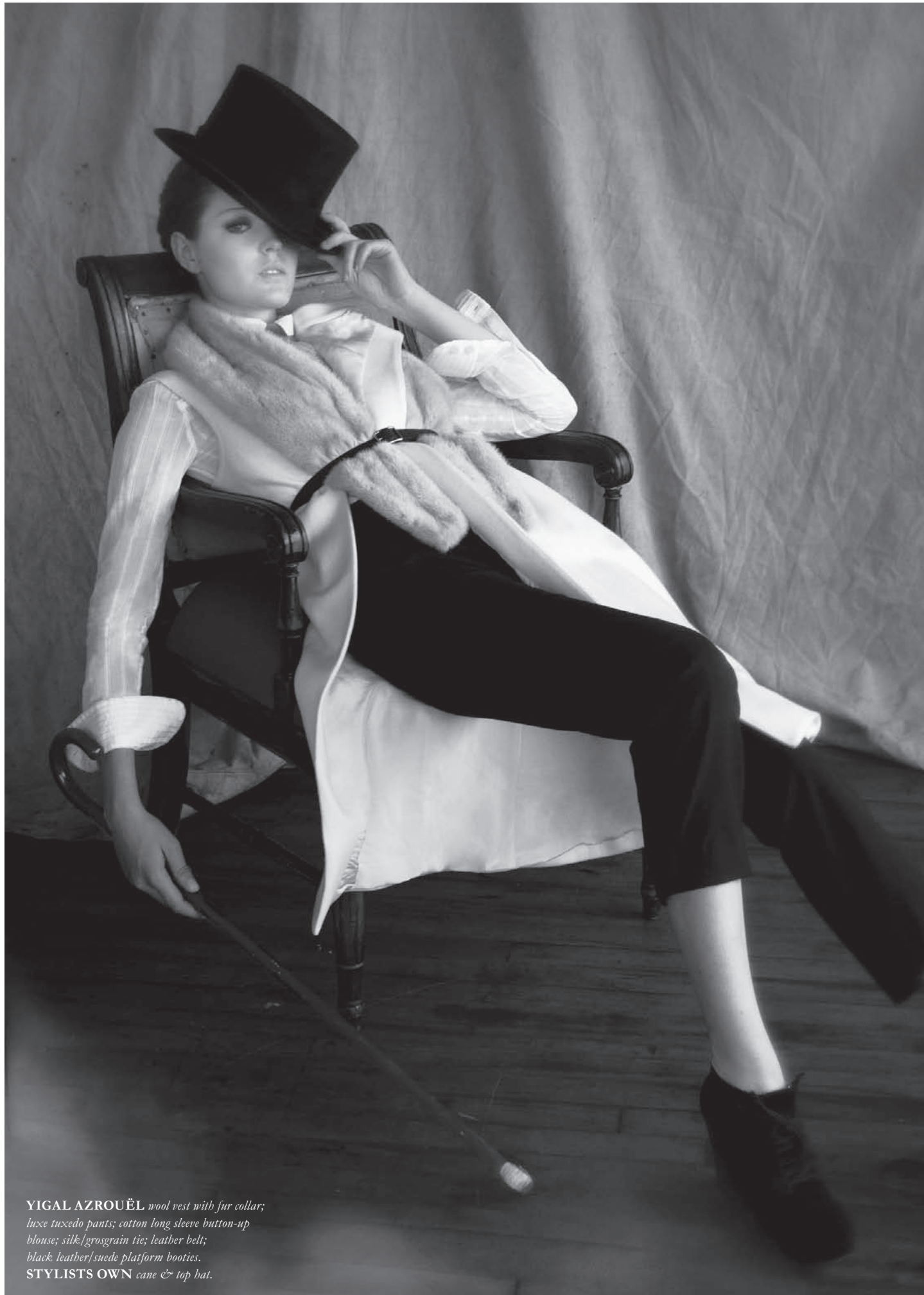
YIGAL AZROUËL wool vest with fur collar; luxe tuxedo pants; cotton long sleeve button-up blouse; silk/grosgrain tie; leather belt; black leather/suede platform booties. STYLISTS OWN cane & top hat.