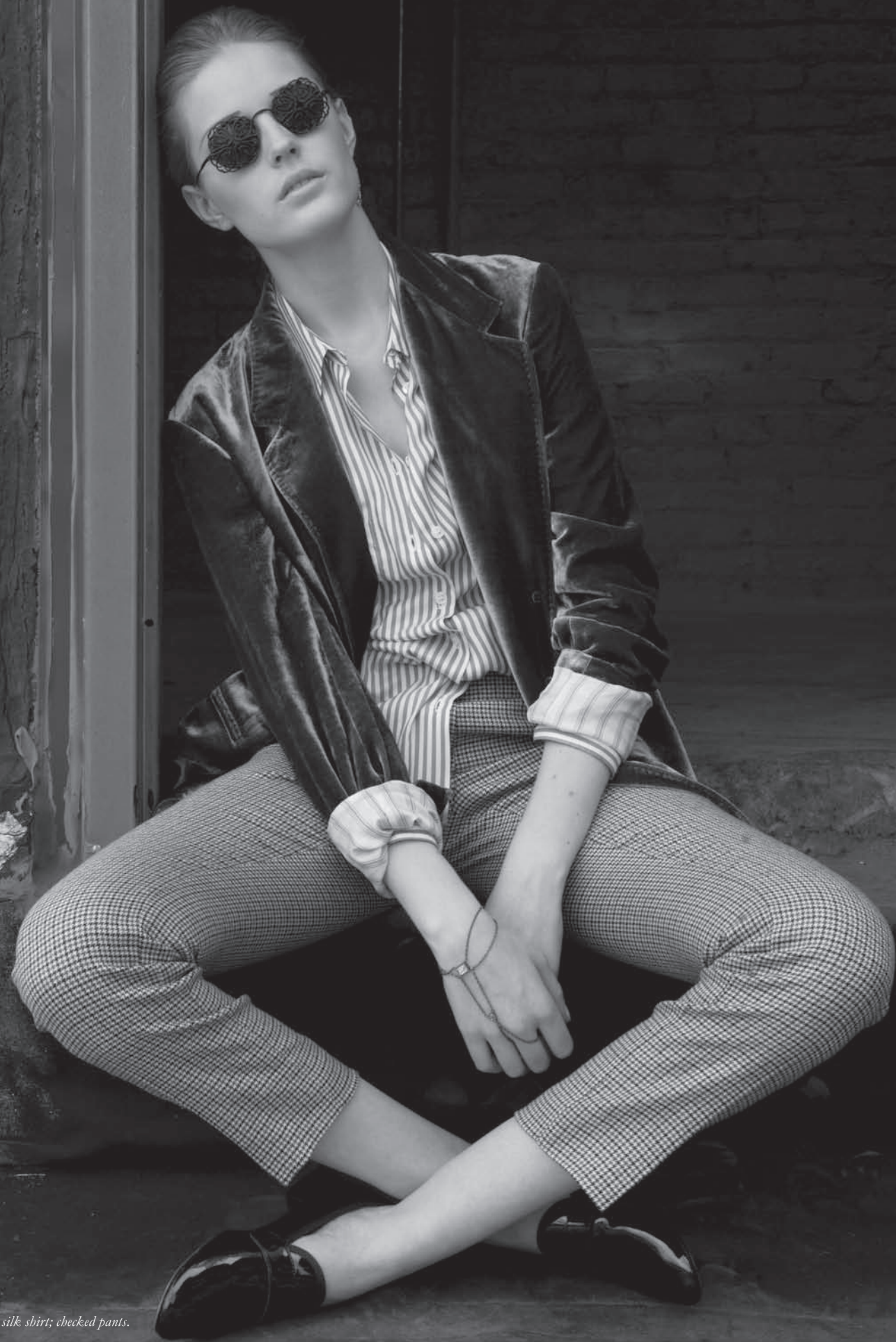
PAUL SMITH velvet blazer; striped silk shirt; checked pants. MERCURA NYC sunglasses. VINTAGE lace scarf. BIJULES cross earring. MADE HER THINK bracelet. REPETTO michael black patent loafers.