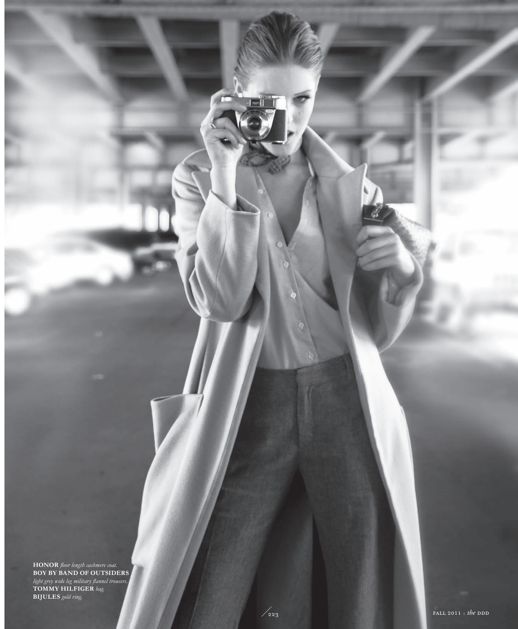
HONOR floor length cashmere coat. BOY BY BAND OF OUTSIDERS light grey wide leg military flannel trousers. TOMMY HILFIGER bag. BIJULES gold ring.