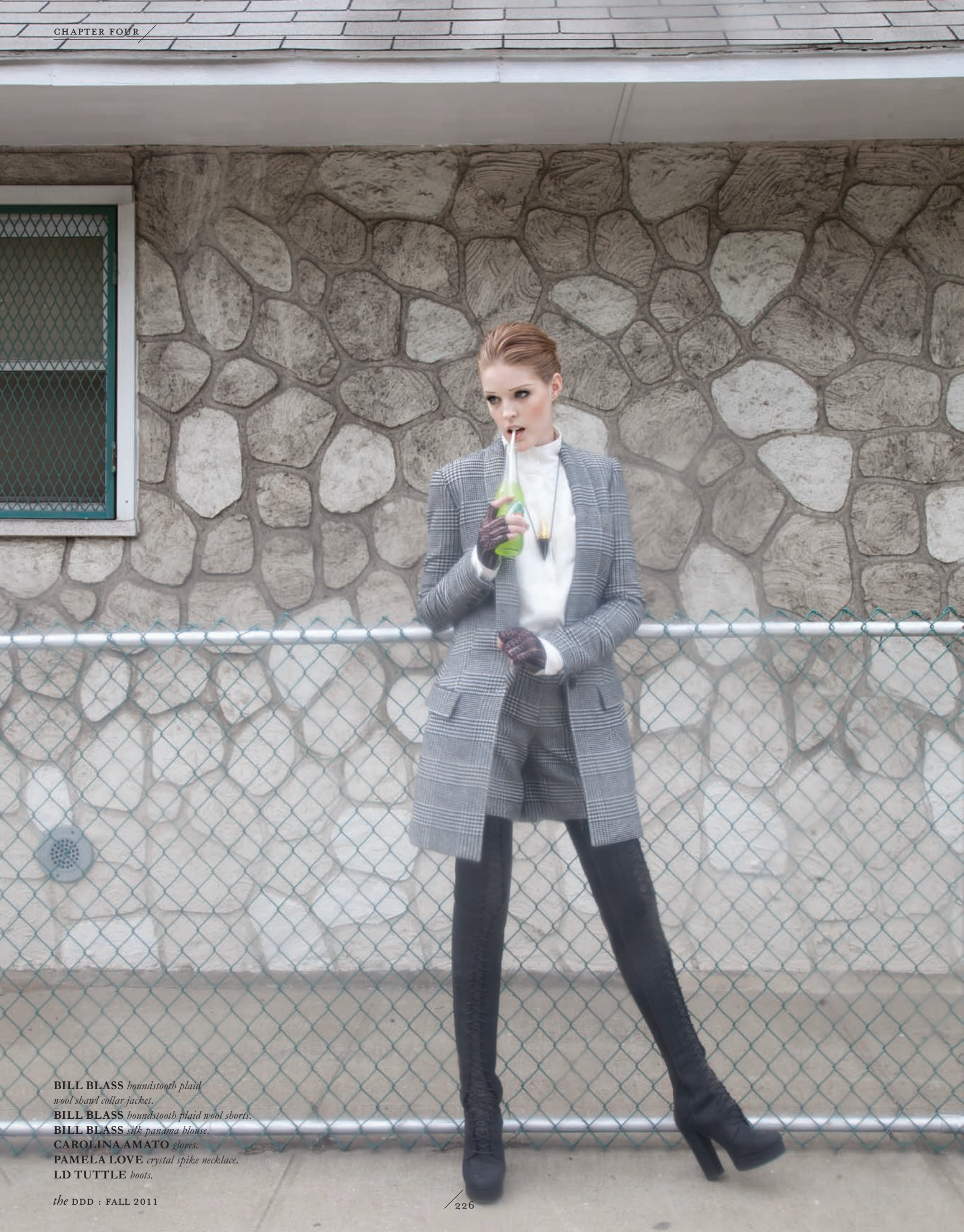
BILL BLASS boundstooth plaid wool shawl collar jacket. BILL BLASS boundstooth plaid wool shorts. BILL BLASS silk panama blouse. CAROLINA AMATO gloves. PAMELA LOVE crystal spike necklace. LD TUTTLE boots.