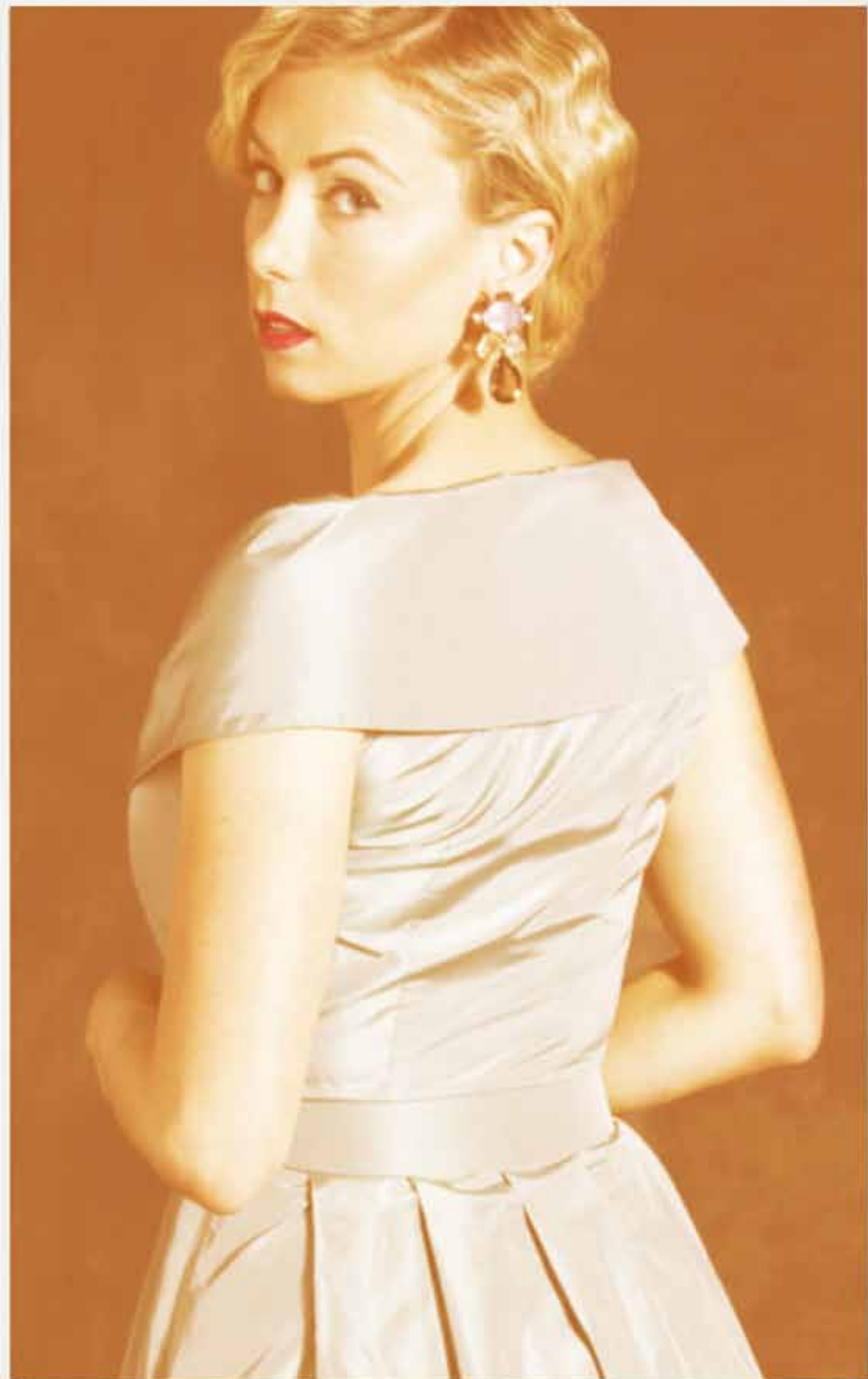
BARBARA TFANK dress . IRADJ MOINI earrings . GIUSEPPE ZANOTTI shoes .