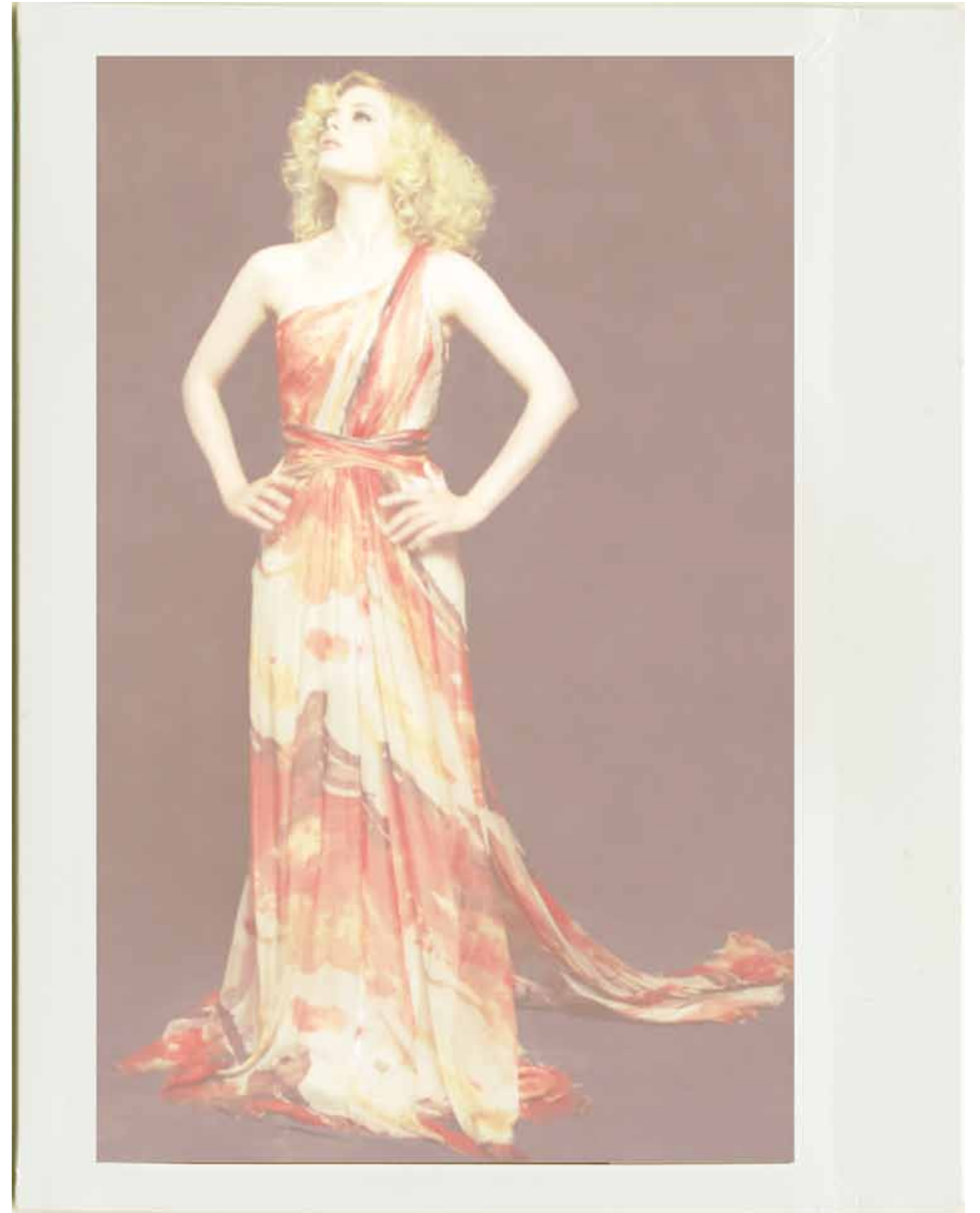
PAMELLA ROLAND dress. SORRELLI NECKLACE bracelet. BCBG MAX AZARIA shoes.