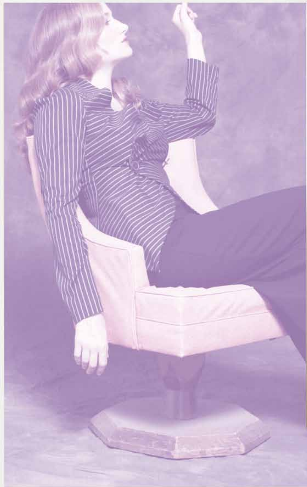
VIVIENNE WESTWOOD blazer. CHRISTIAN COTA skirt. GIUSEPPE ZANOTTI shoes. AMERICAN APPAREL stockings.