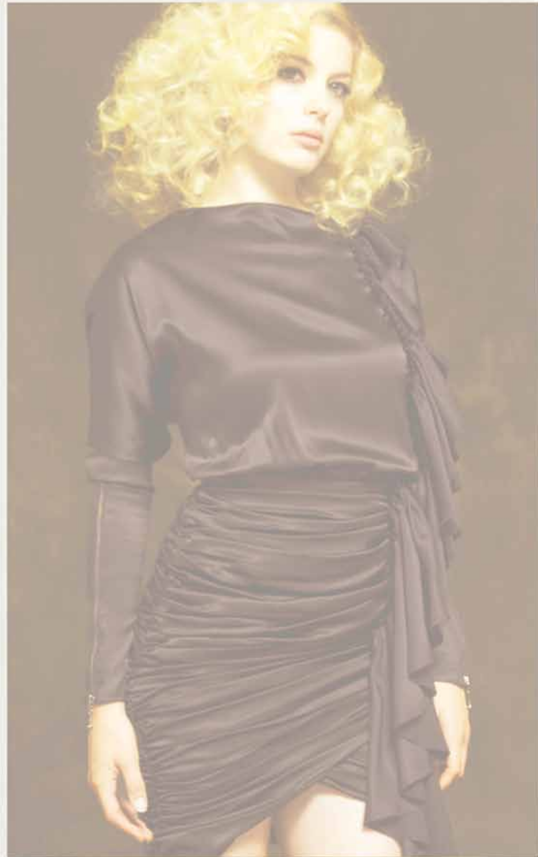
TADASHI SHOJI dress. IRADJ MOINI ring. HERVE LEGER shoes.