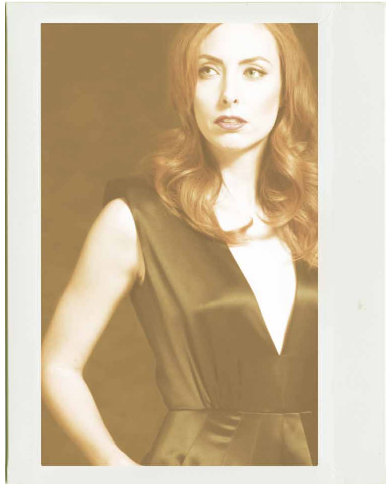
THOMAS WYLDE dress. DOUGLAS HANNANT shoes.

EG: Whitney Cummings is happening a lot now. If you saw us in person, there's no way you could mistake us for one another, but we're both brunette comedians, so I guess we're the same person? You know, just like how everyone always thinks that Tim Allen and Jeff Dunham are the same person.