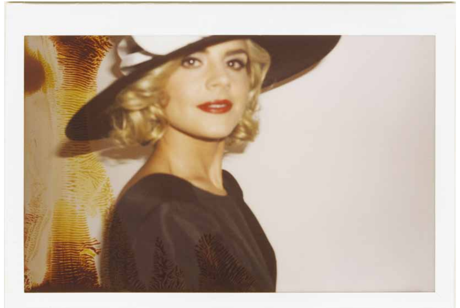
JASON WU dress. PHILIP TREACY LONDON hat. SWAROVSKI ring. AMERICAN APPAREL stockings. MANOLO BLAHNIK shoes.