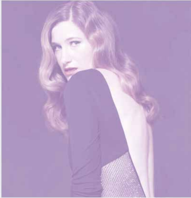
ABS dress. SWAROVSKI ring. GIUSEPPE ZANOTTI shoes.

Step Brothers and got that part, which cemented my confidence with being able to do it. It was fun to be able to jump off a cliff and know that you'd be caught. You didn't have to have any fear. That was the start of it.