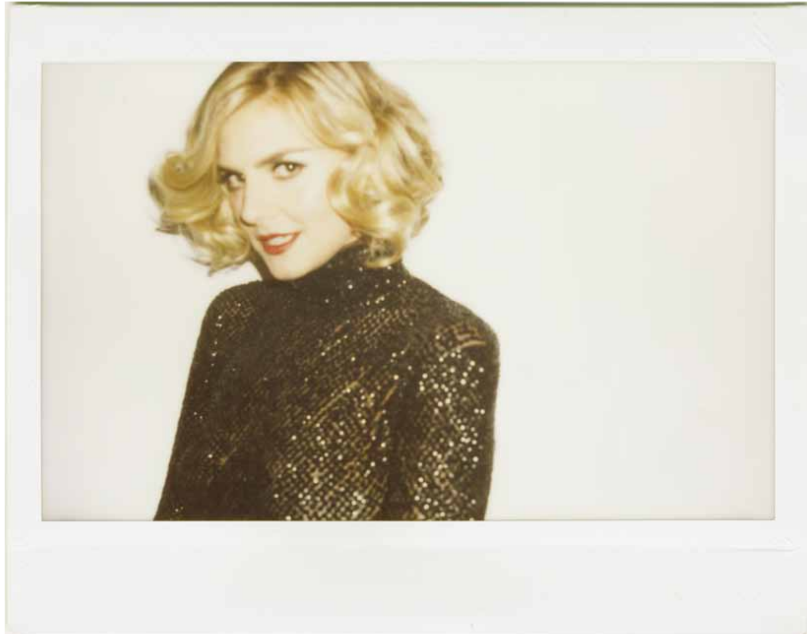
JEAN PAUL GAULTIER jumpsuit. LORENA SARBU fox fur. LOREE RODKIN ring.