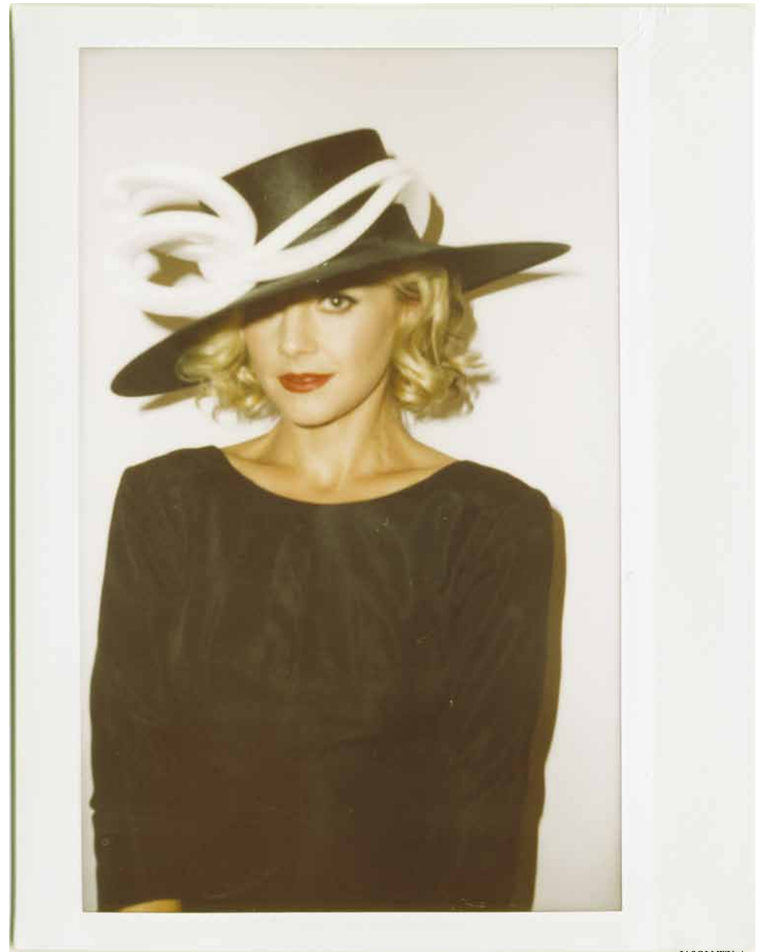
JASON WU dress . PHILIP TREACY LONDON hat . SWAROVSKI ring . AMERICAN APPAREL stockings . MANOLO BLAHNIK shoes .

EC: Jim Carrey in Ace Ventura . Johnny Depp—it sounds weird, and it's not because I want to have sex with him. There's something about the roles that he chooses that is really fascinating. I really admire Robert Downey, Jr. I do look to Kristen Wiig; I think she's talented and really smart. Lily Tomlin of course, Gilda Radner. Will Ferrell for sure, he's a big one for me. Eddie Izzard, I fucking love Eddie Izzard. And Robin Williams. And Sacha Baron Cohen, he's pretty brilliant. I got to meet him, I had an audition with him once—it was the best audition I've ever had, I got to improv with him for like 30 minutes. I didn't get the part, but it made my day, it made my year quite honestly.