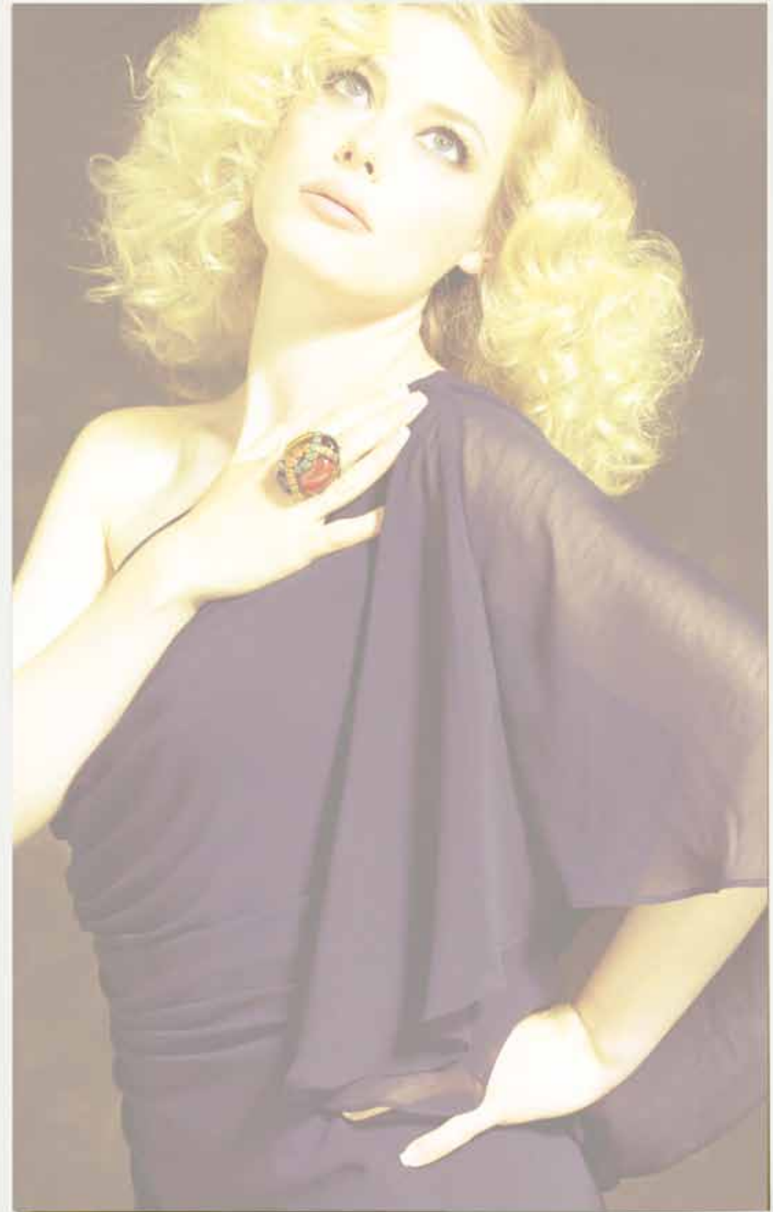
THOMAS WYLDE dress. GIUSEPPE ZANOTTI shoes.