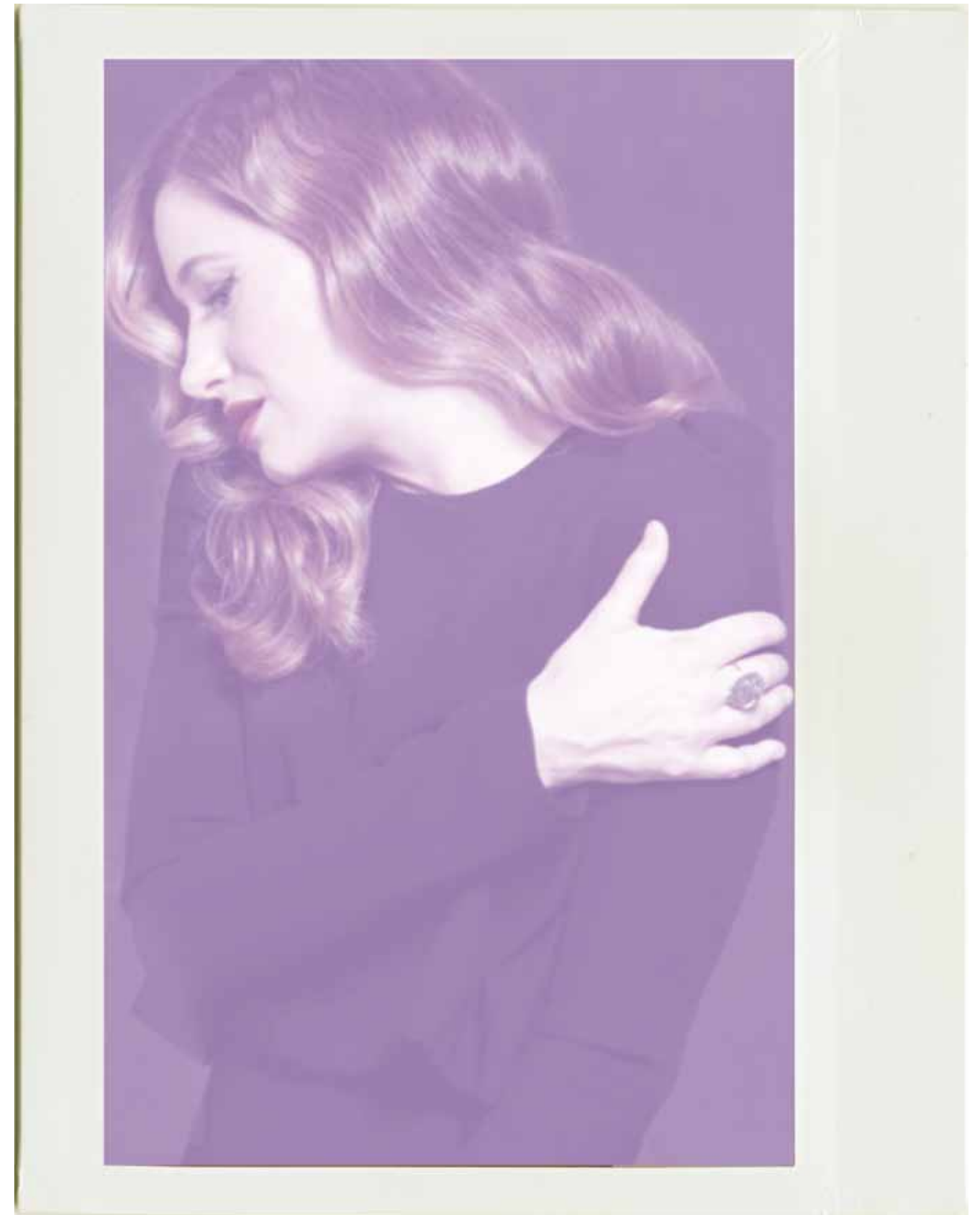
MONIQUE LHUILLER dress. AMERICAN APPAREL stockings. SWAROVSKI ring. LA RARE shoes

“[In my career] there's been a lot of “nos”, and the “yeses” have been things I've been thrilled to do. I think that roles I try to play in these comedies are the crazy, on-the-periphery ones. I've been blessed that I've been trusted by the directors and the writers to go there in those parts. I think it's an exciting time for women and women comic actors. Everyone's been talking about Bridesmaids... I walked out with the biggest smile on my face. I was so excited about being a girl, so excited about the future, so fresh and filled with possibilities.”