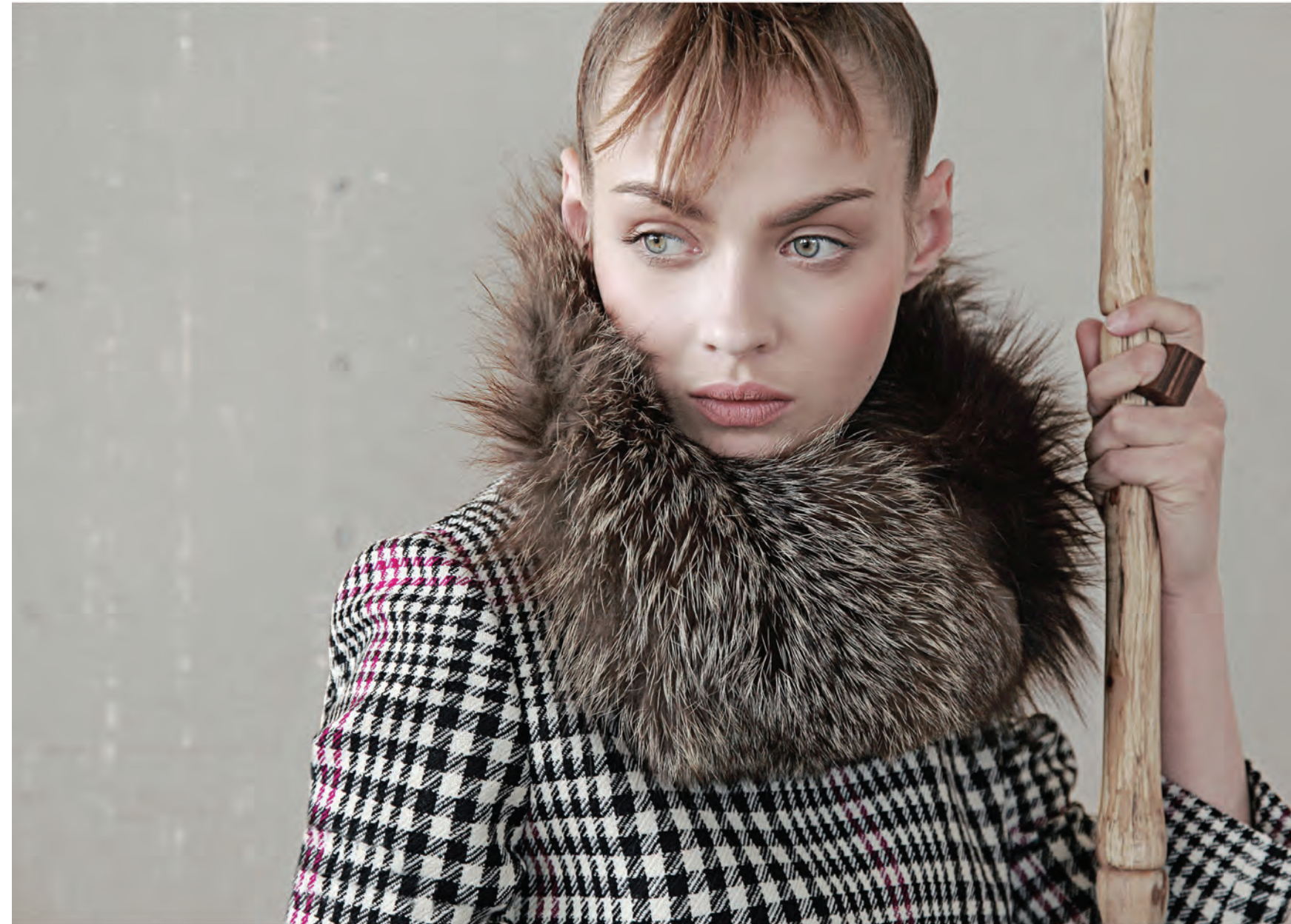
EYE OF THE WORLD DESIGNS fur piece. YSL checked dress. EYE OF THE WORLD DESIGNS square mahogany ring. EYE OF THE WORLD DESIGNS wooden staff.