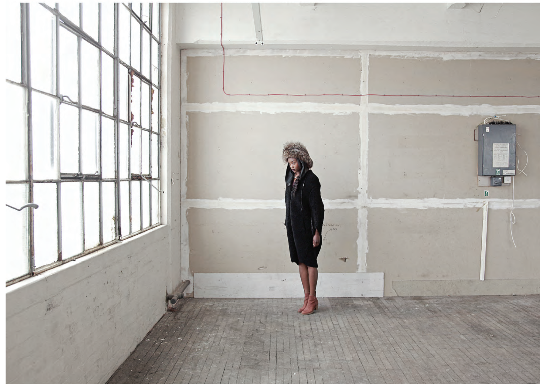
ACNE sheepskin coat 3/4 length with leather hood. ACNE boots. MAWI necklace. EYE OF THE WORLD DESIGNS FUR hat.