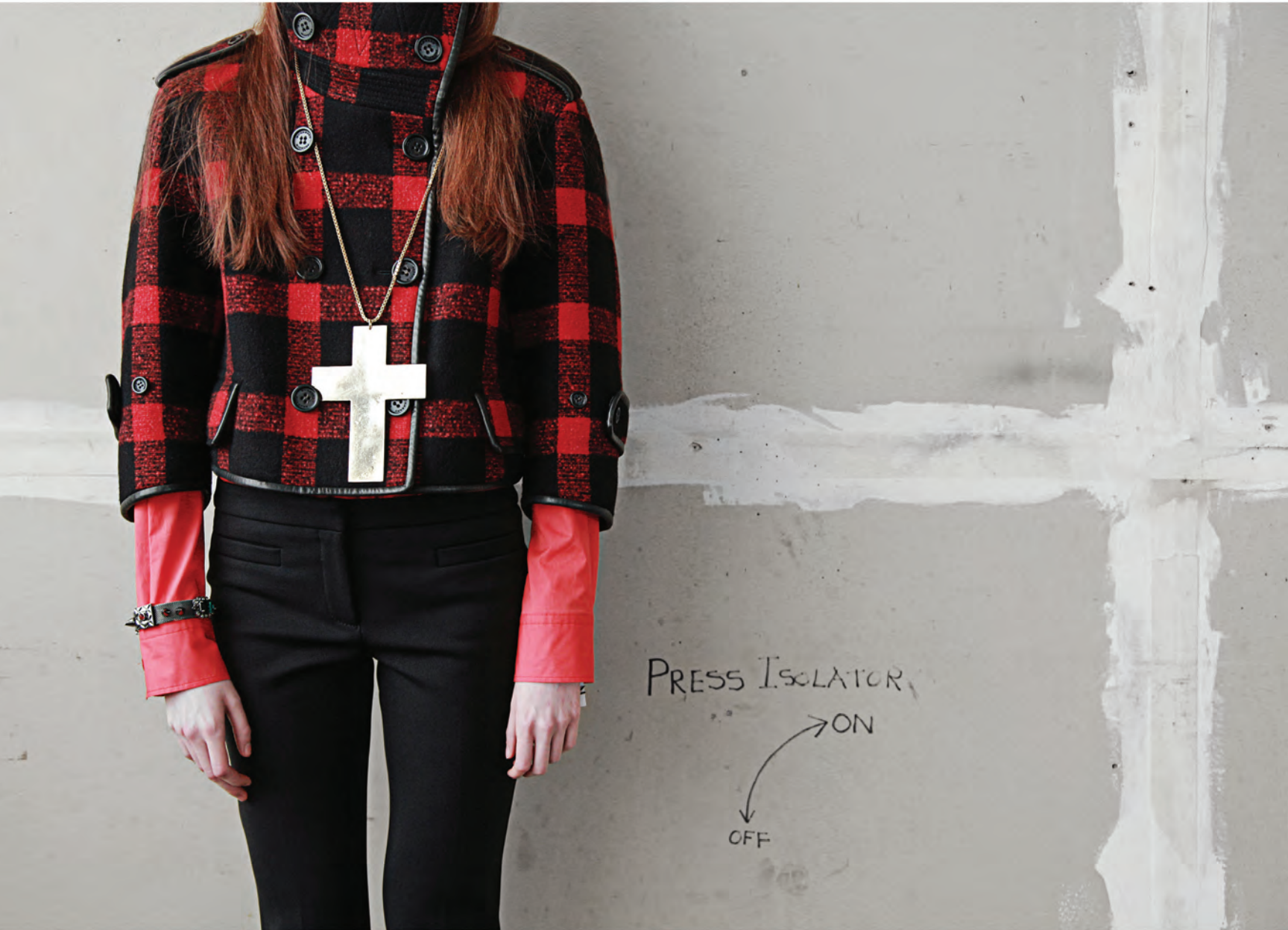
BURBERRY tartan red jacket. PAUL SMITH red shirt. MAWI bracelet. BURBERRY TRS. MARIA FRANCESCA PEPE necklace.