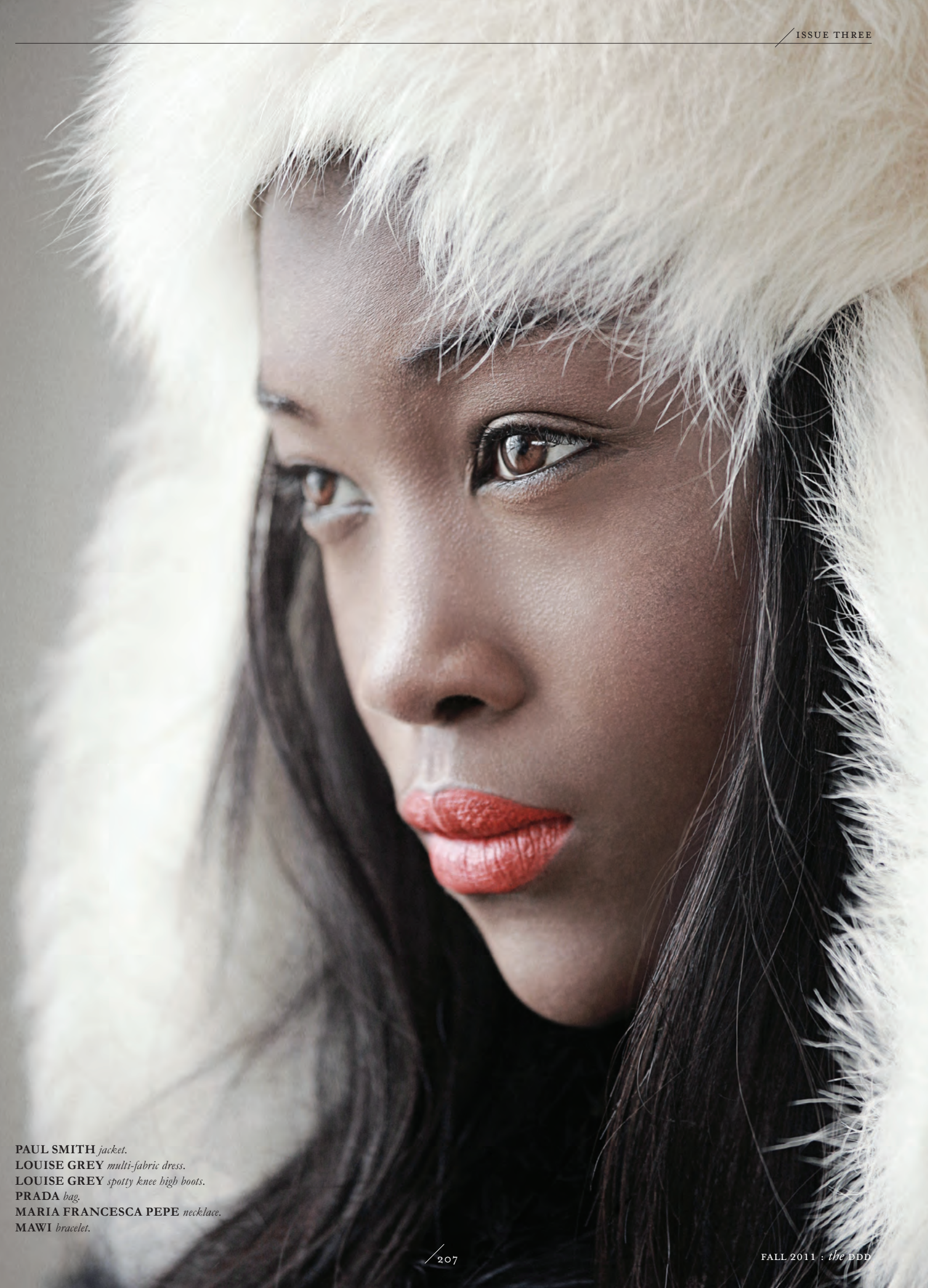
PAUL SMITH jacket. LOUISE GREY multi-fabric dress. LOUISE GREY spotty knee high boots. PRADA bag. MARIA FRANCESCA PEPE necklace. MAWI bracelet.