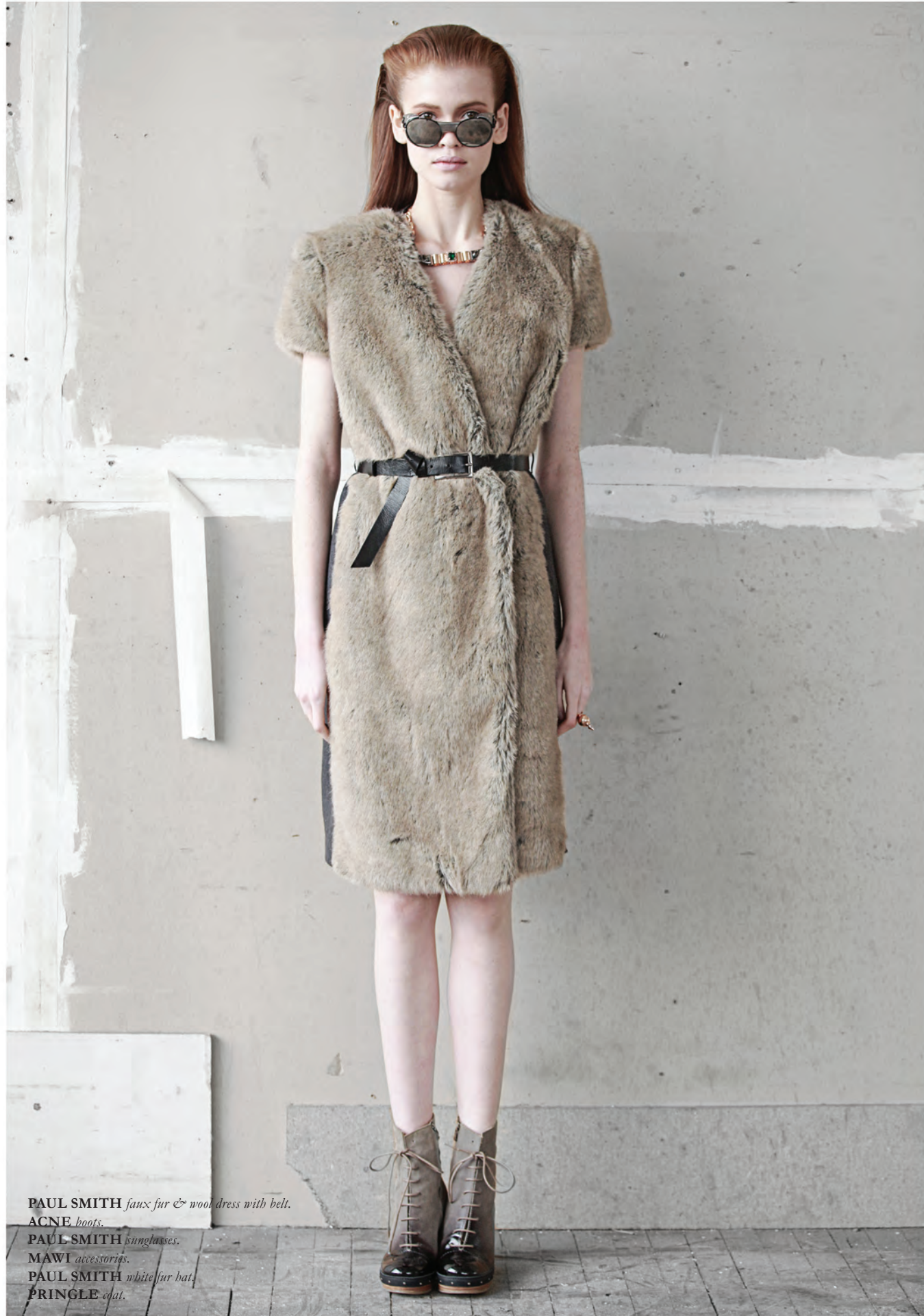
PAUL SMITH faux fur & wool dress with belt. ACNE boots. PAUL SMITH sunglasses. MAWI accessories. PAUL SMITH white fur hat. PRINGLE coat.