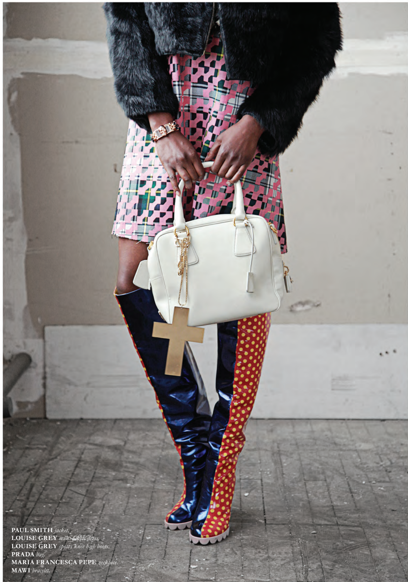
PAUL SMITH jacket. LOUISE GREY multi-fabric dress. LOUISE GREY spotty knee high boots. PRADA bag. MARIA FRANCESCA PEPE necklace. MAWI bracelet.